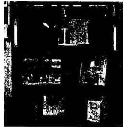
A cabinet (left) contains the Lasker Award, given to AA in 1951, copies of the Saturday Evening Post and Liberty Magazines that ran articles on AA, a manuscript copy of the Big Book, and other memorabilia. Below, the microfilm viewer is used by an AA member to look over some historical documents.