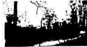
New York City drunks attended Oxford Group meetings at Calvary Church (left) near historic Gramercy Park (lower right), then moved on to AA meetings in Bill and Lois's home at 182 Clinton Street, Brooklyn Heights.

the dangers of bringing alcoholics into your home; that love alone was not the answer, in fact it was often counterproductive, leading to over-protection and "institutionalism."