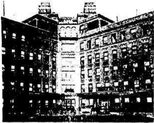
Brooklyn's St. John's Hospital

It was at the fag end of Winter, 1945, that the working founders of The Knickerbocker Plan began to tackle their job with earnest determination.