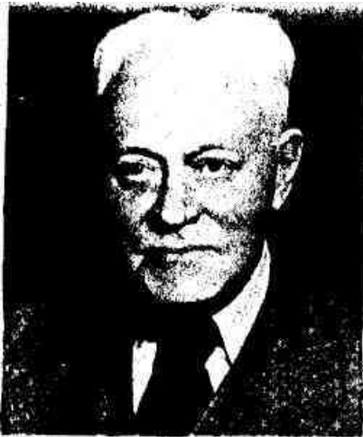
with understanding guidance... Dr. William Duncan Silkworth

been as enlightening as the lessons of organization. Experiences have ranged from the ludicrous to the tragic.